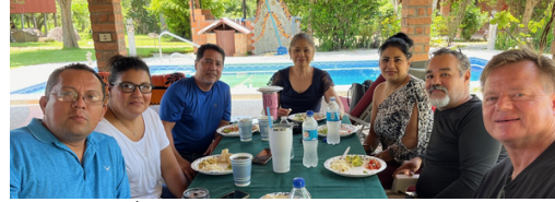
Mexican Pastor Luncheon

We hosted a lunch with Mexican pastors at our house to determine how their churches could use our property. They saw potential for men's and women's retreats, marriage retreats, pastor planning sessions, and teen camps. Using our home could enable more attendees, as cost is a limiting factor for many families.